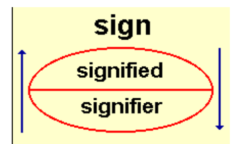
Figure 1: Signifier-Signified Dichotomy