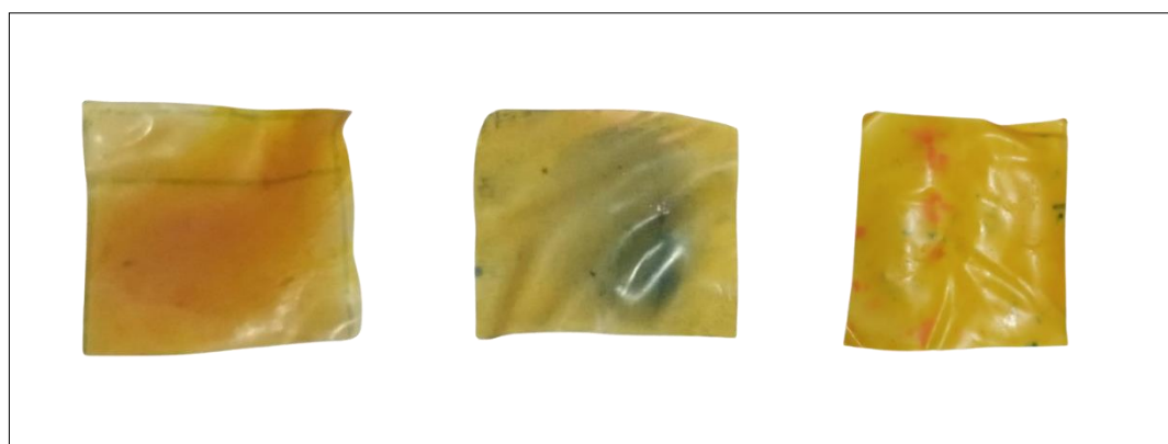
Figure 3. Showing the color variation of films in response to varying pH