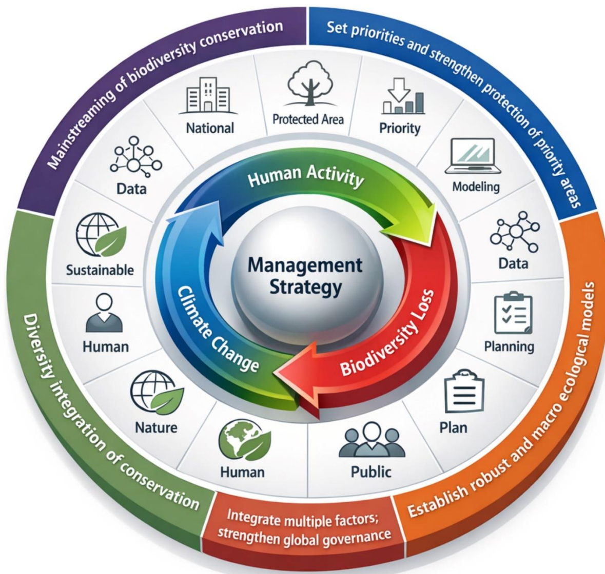
Figure 1 Integrated Framework for Freshwater Biodiversity Conservation and Global Governance